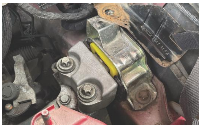
Figure 5: Fit to car