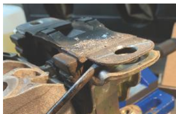
Figure 3: Separate two halves