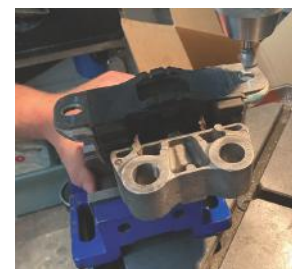
Figure 2: Drill swaged holes