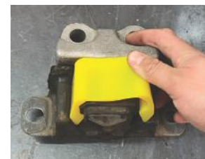
Figure 4: Push insert into place