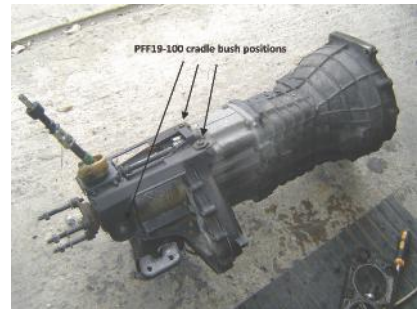
Figure 1- Location of OEM bushes to remove and replace.