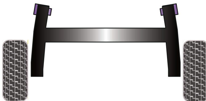
Figure 2 - Rear Beam