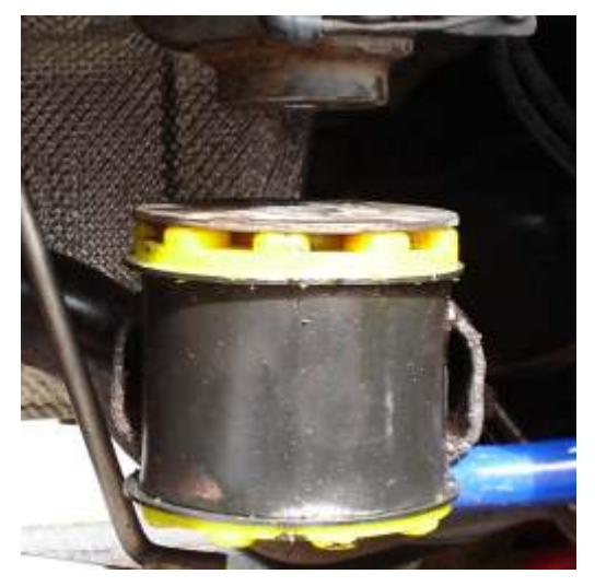
Fig 2. Rear mount - OE washers shown.